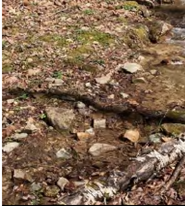
Flint Mountain Trail