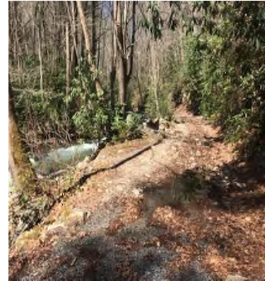
Rocky Fork Trail